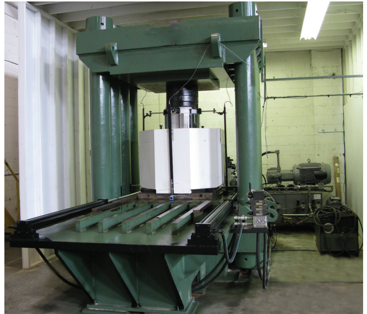
▲ AGC / HGC Cylinder Test Stand